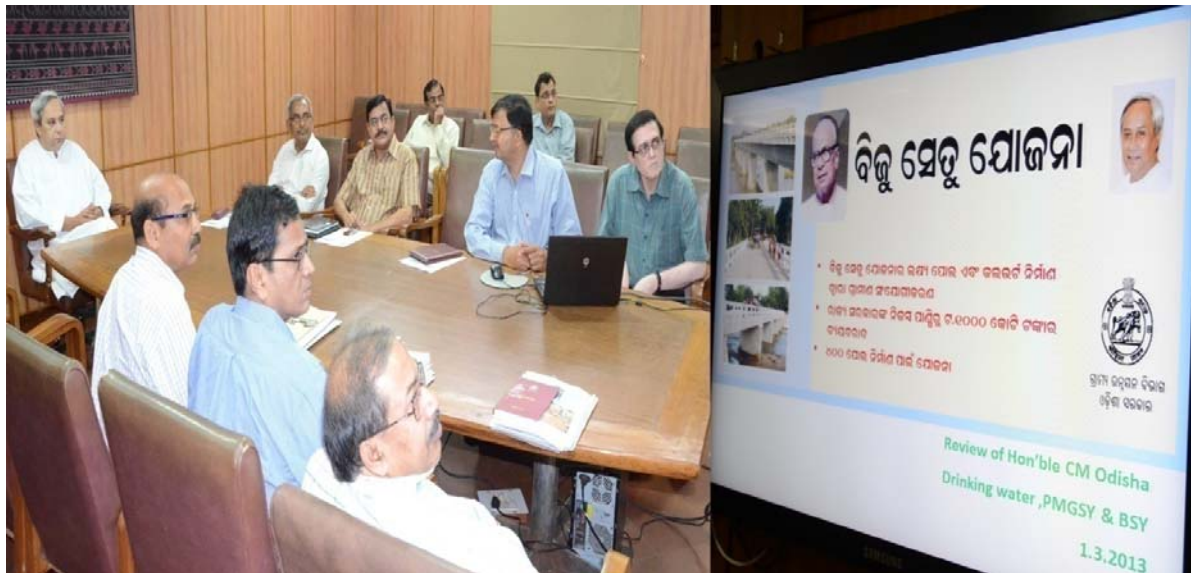
Hon'ble Chief Minister Odisha taking review of departmental activities of DoRD on 1 st March 2013 .....Outcome budget of 2012-13